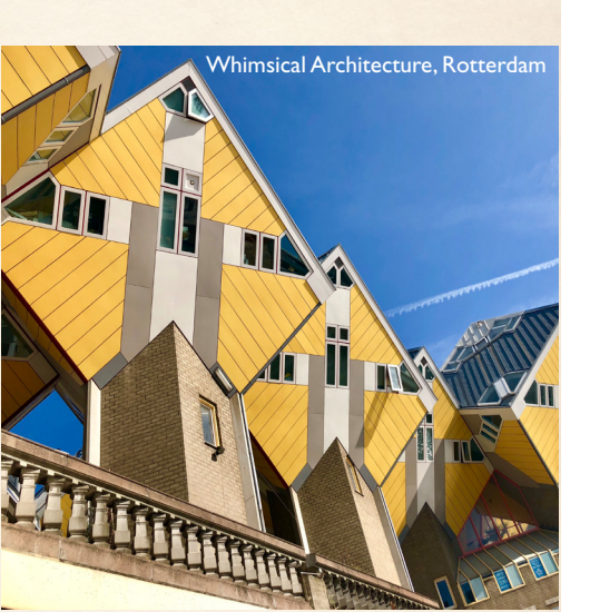
CRUISE HOLLAND AND BELGIUM FEATURING YOUR MODERN "FLOATING HOTEL" THE M/S CRUCEVITA