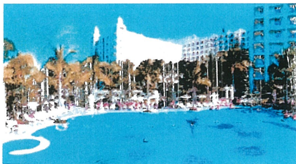
Riu Vallarta Hotel (above and right)